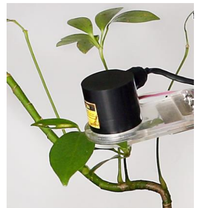
Leaf temperature measurement using IR technology.