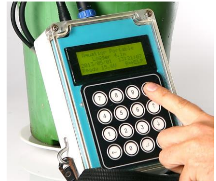
Portable Datalogger with High Contrast backlit screen for use in bright sunlight.