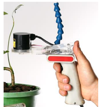
PAR measurement using cosine corrected 2 \pi sensor.